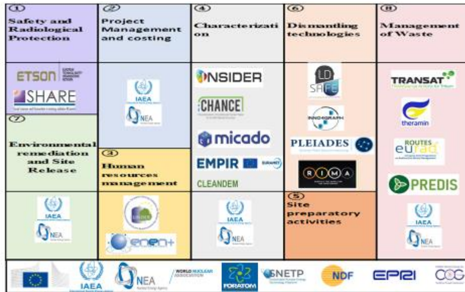
Figure 2 :Illustration of Second workshop breakout session linked to other European initiatives

attendance of more than 150 externals to the consortium. Further details are available on D5.8: Workshop on identified gaps.